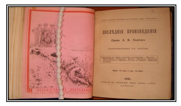
Example of Tolsoy's pamphlets, banned in Russia

The Library holds a particularly rich collection of Tolstoy's works from the 1890s and 1900s, including, notably, his banned works, his less well-known religious and philosophical works, and also criticism of his literature and thought from this period. There is also a considerable number of reprints of Tolstoy's works from 1917, and re-readings of his works in the light of the revolution. The